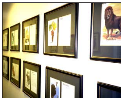
The "Character Wall" at Ambassador is just one example of how organizations are setting the tone for their corporate culture by emphasizing character