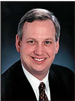
Indianapolis Mayor Bart Peterson

Indianapolis has launched a unique effort in protecting the city's youth. As of September 1st, 2000 minors within the city have been banned from arcade games depicting violent or sexual activities. The ordinance was one of the first proposals from Mayor Peterson