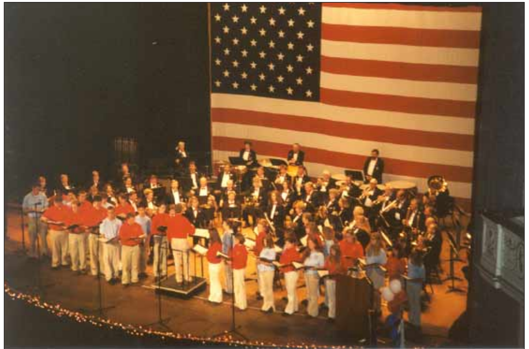
Choir members from Elkhart high schools perform "Battle Hymn of the Republic" with accompaniment from the Elkhart Municipal Band at a "United We Stand: A Tribute to the Character of America" concert at the Elco Theatre on October 21st.

The following was released to the press from Character First of Elkhart on October 22nd.